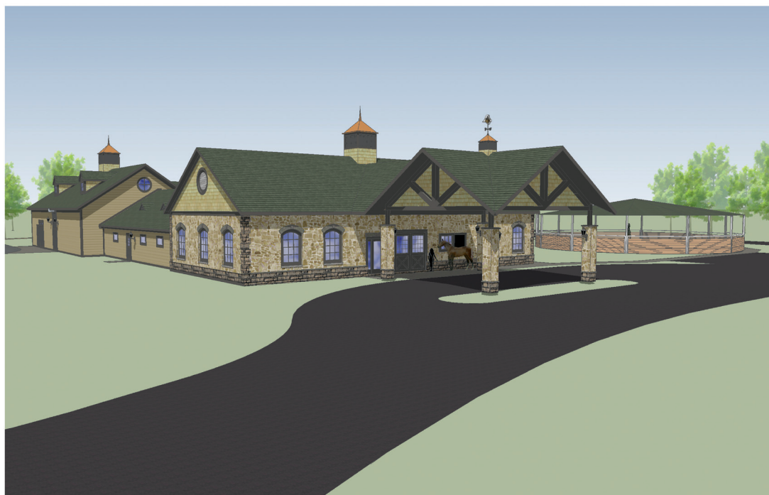
Architect's rendering of the Centaur Equine Specialty Hospital.